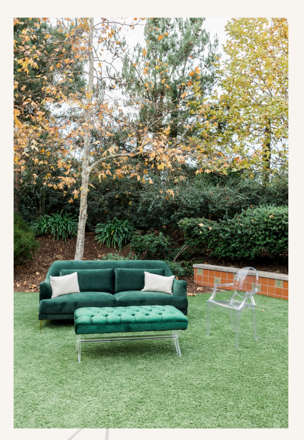
Sofa Forest Green Velvet $350 Lounge Chair Ghost Clear $35