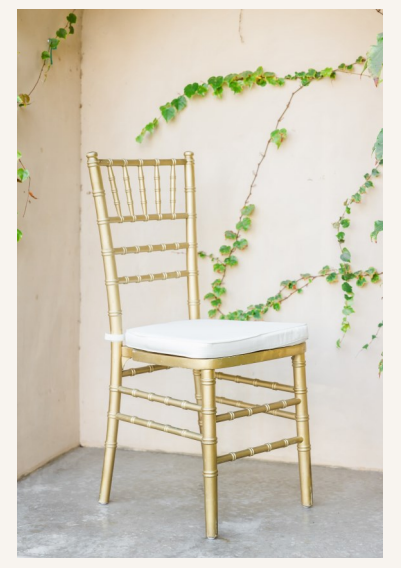
Gold Chiavari $9