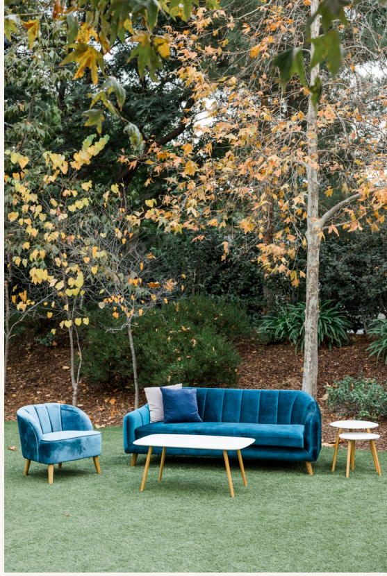
Sofa Blue Velvet $350 Lounge Chair Velvet Blue $90 Coffee Table Isabella White $90 2 Piece Side Table White Mia Set $65