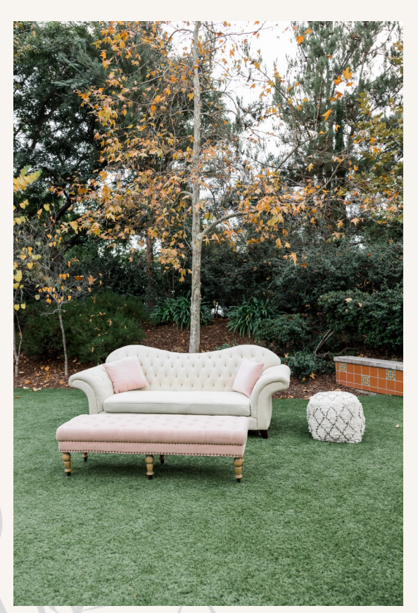
Sofa Tufted Oatmeal $290 Pouf Moroccan Wool $60

All furniture is priced a la carte and can be mixed and matched. There is one of each item. Pillows and flower arrangements encouraged. Pillows not included.