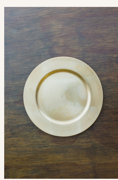
Gold $2.50 per charger