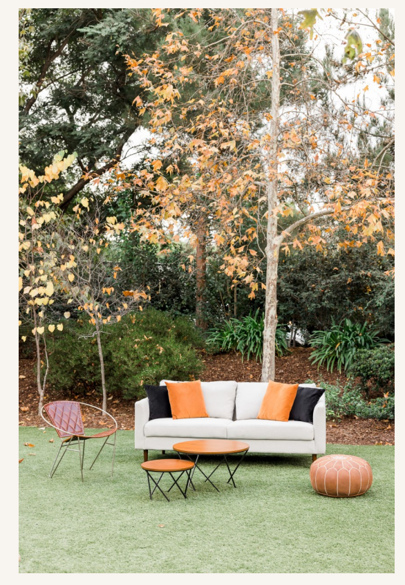
Sofa Herringbone Antique White $290