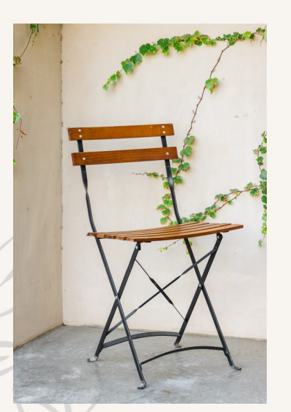
Garden Steel and Wood $8