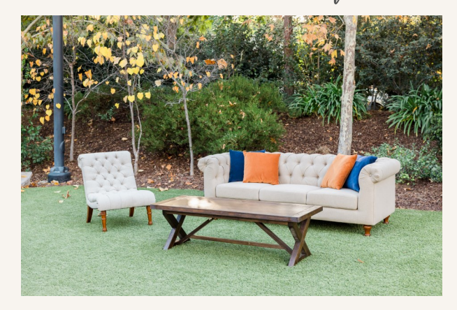
Sofa Beige Tufted $290 Lounge Chair Victorian Oatmeal $90 Coffee Table Vineyard Brown $90