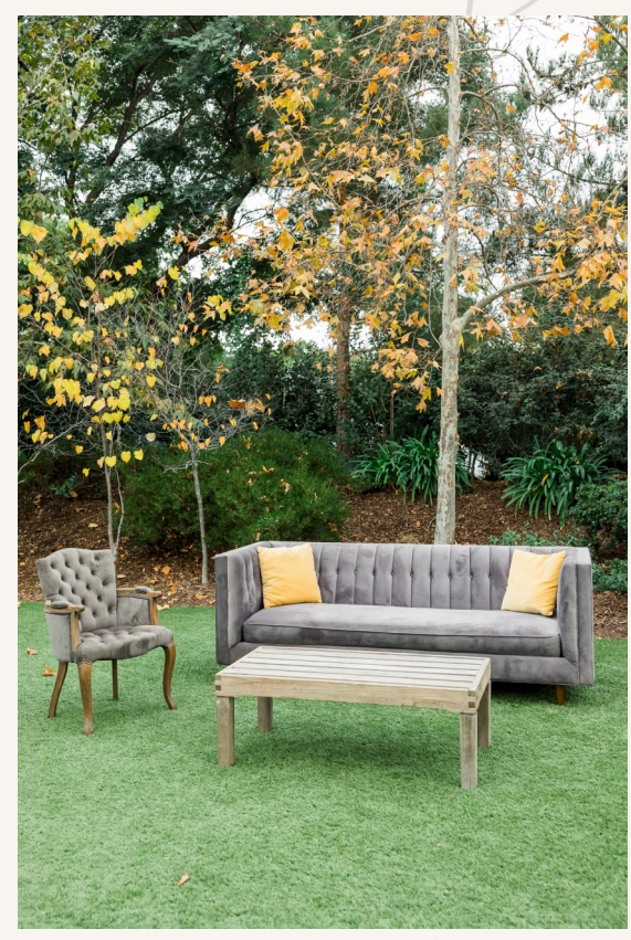
Sofa Grey Velvet $350 Lounge Arm Chair Velvet Charcoal $90 Coffee Table Weather Grey $90