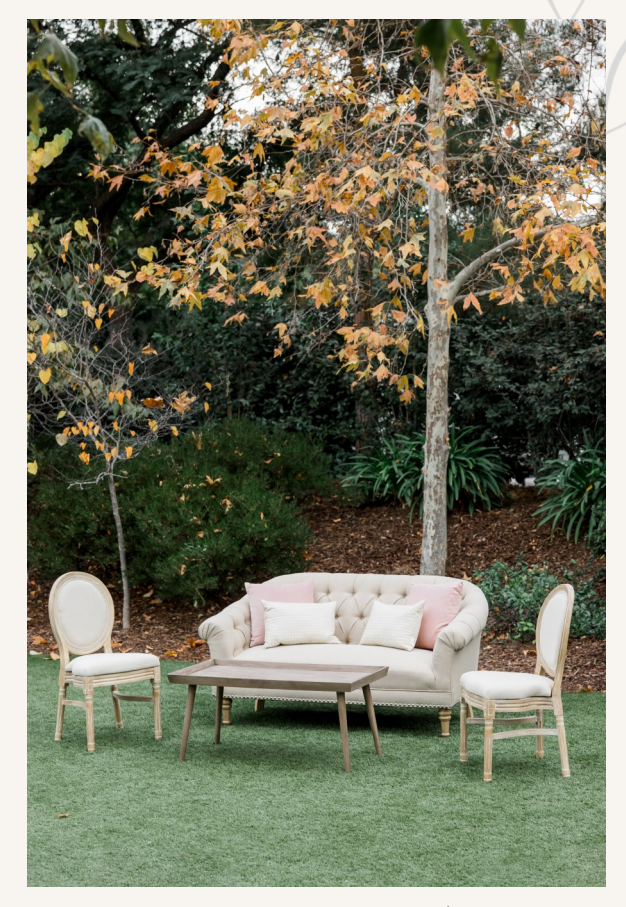
Tufted Cream Settee $240 Lounge Chair Louis Grey Dust $35 Coffee Table Desert Brown Tray Top $90

Black Velvet Settee $275 Lounge Chairs Black Leather Tufted $90 Coffee Table Saleen White $80 Side Table Saleen White $65