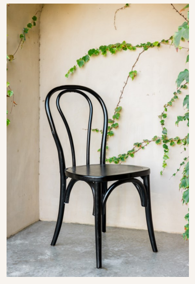
Brentwood Black $11