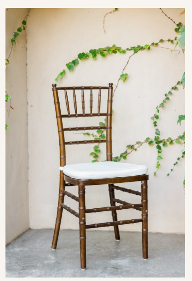
Fruitwood Chiavari $9