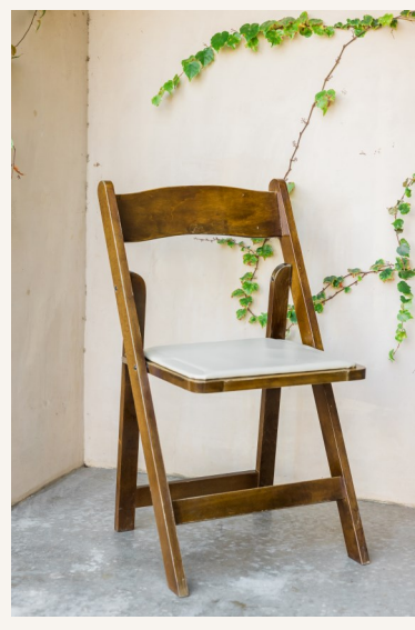
Fruitwood Folding $7