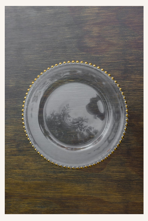
Gold Ball Glass $4.50 per charger