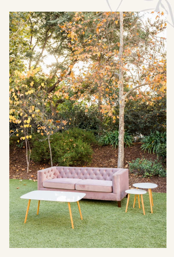
Sofa Velvet Blush Pink $350 Coffee Table Isabella White $90 Side Tables Mia White 2 Piece Set $65

Lounge Chair Brown Leather $90 Pouf Moroccan Brown Leather $60