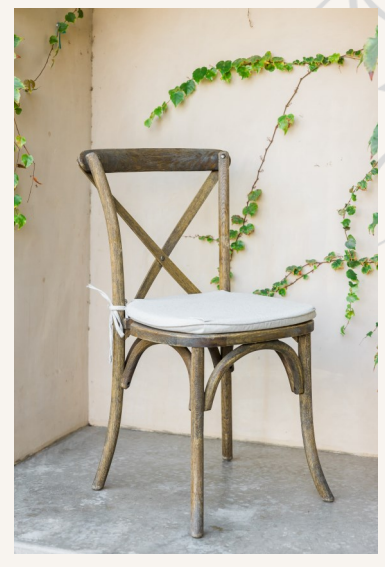
Vineyard Cross Back $12